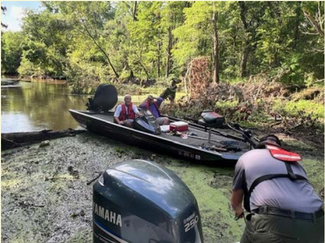
Park rangers assisting boater stranded on submerged log.