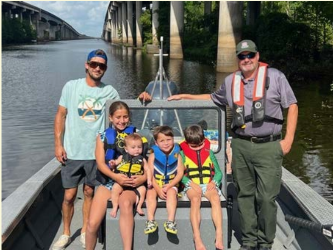
Ranger Soileau conducting water safety instruction with family at Butte LaRose.