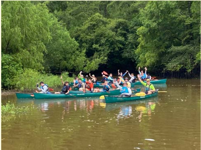
Boys Scouts were very appreciative of the Park Ranger's success in clearing the obstructions in Bayou Fordoche