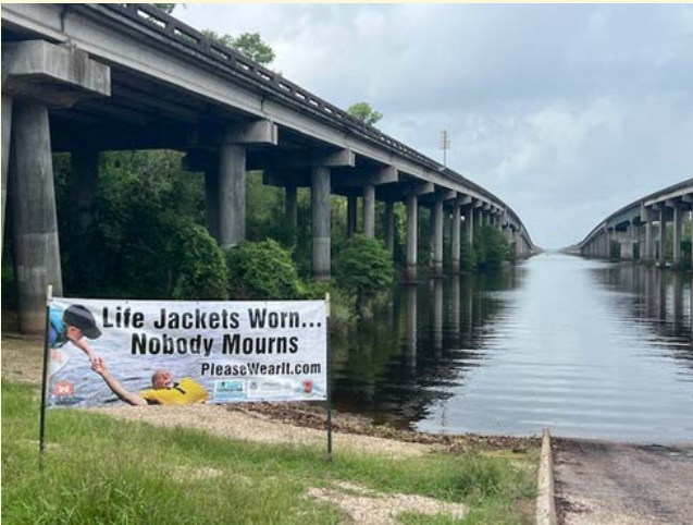
Water Safety banner at Butte LaRose boat launch.

Approximately 200 contacts were made in Atchafalaya Basin.